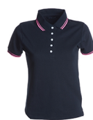
NAVY BLUE/NEON FUCHSIA