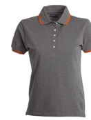
ASH GREY MELA NGE/ORANGE