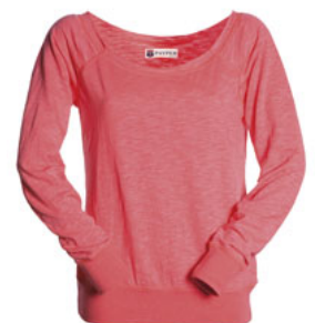
MELANGE CORAL HOT