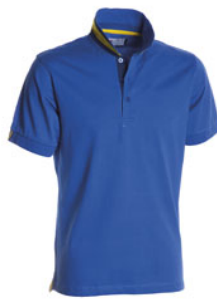
ROYAL BLUE/YELLOW- NAVY BLUE