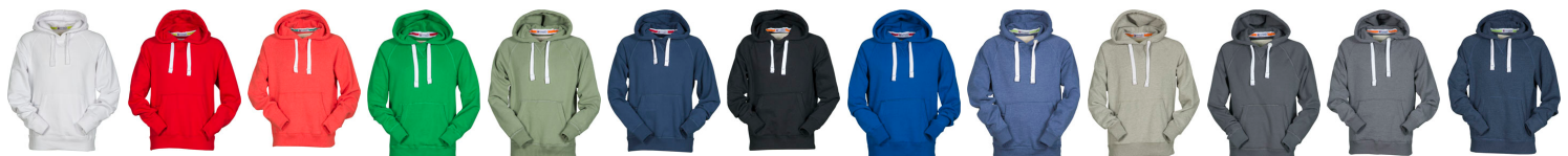
WHITE RED MELANGE POPPY RED JELLY GREEN ARMY GREEN DENIM BLUE BLACK ROYAL BLUE MELANGE LIGHT DENIM MELANGE GREY STEEL GREY MELANGE STEEL GREY MELANGE DENIM BLUE