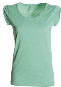
MELANGE JELLY GREEN