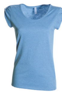
MELANGE BLUE SUGAR