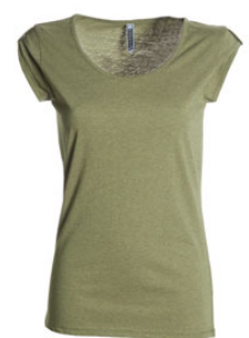
MELANGE ARMY GREEN