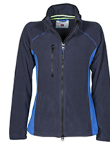
NAVY BLUE/ROYAL BLUE