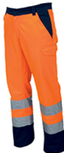
FLUORESCENT ORANGE/NAVY BLUE