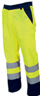
FLUORESCENT YELLOW/NAVY BLUE