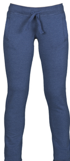
MELANGE LIGHT DENIM