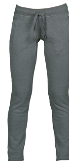
MELANGE STEEL GREY