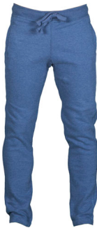
MELANGE LIGHT DENIM