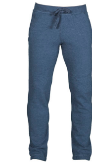
MELANGE DENIM BLUE