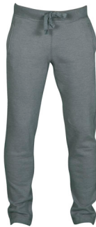
MELANGE STEEL GREY