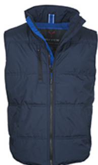
NAVY DRESS BLUE/ROYAL BLUE