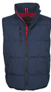
NAVY DRESS BLUE/RED