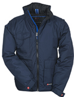
NAVY DRESS BLUE/ROYAL BLUE