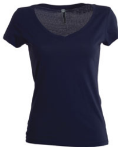
NAVY BLUE SEAPORT