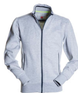
MELANGE GREY/NAVY BLUE