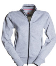
MELANGE GREY/NAVY BLUE