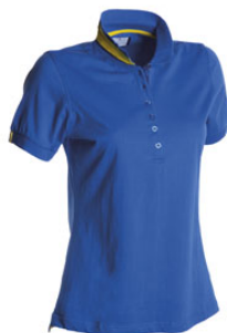
ROYAL BLUE/YELLOW- NAVY BLUE