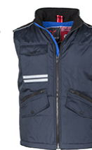
NAVY BLUE/ROYAL BLUE