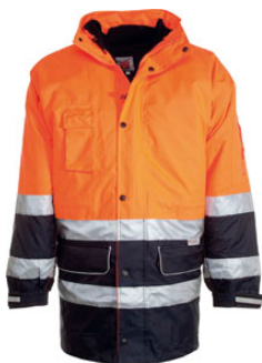
FLUORESCENT ORANGE/NAVY BLUE