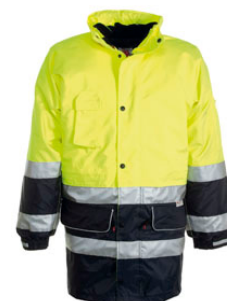
FLUORESCENT YELLOW/NAVY BLUE