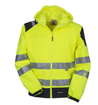
FLUORESCENT YELLOW/NAVY BLUE