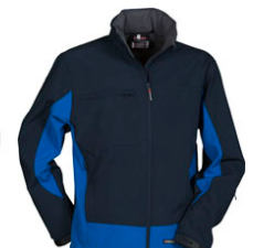
NAVY BLUE/ROYAL BLUE