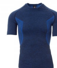
MELANGE ROYAL BLUE