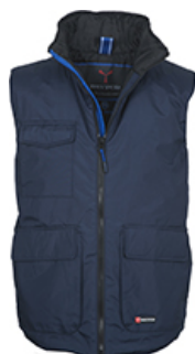
NAVY DRESS BLUE/ROYAL BLUE