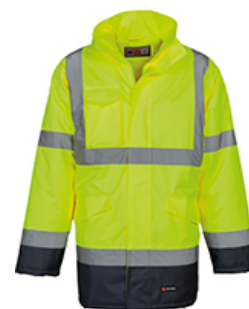
FLUORESCENT YELLOW/NAVY BLUE