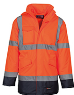
FLUORESCENT ORANGE/NAVY BLUE